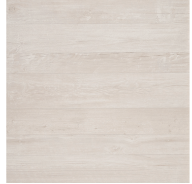
AXI White Pine