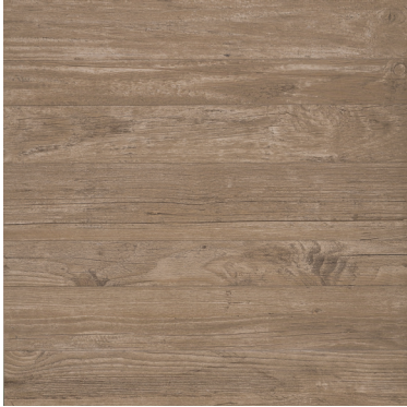
AXI Brown Chestnut