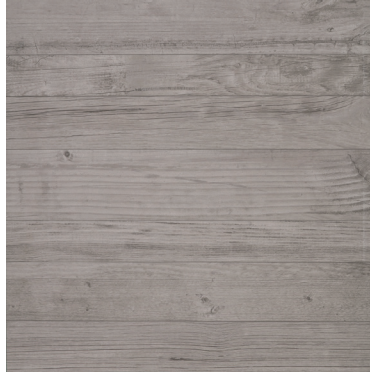
AXI Grey Timber